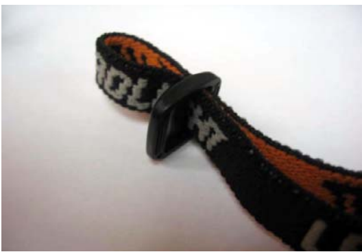
3) Bend the end of strap across the hole of clip