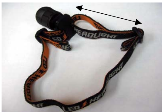
7) adjust the length of strap.