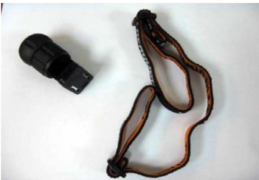
5) Proceed stage 3 and 4 for other end of strap