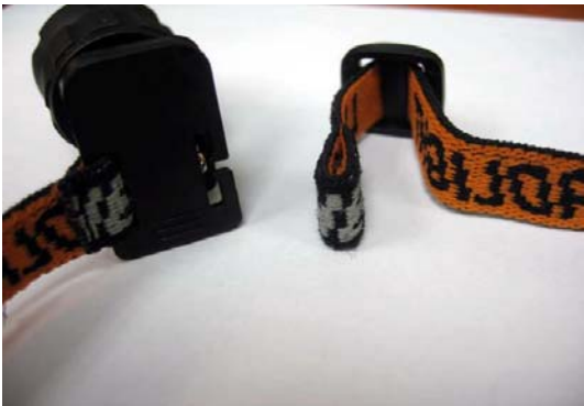
1) Remove the strap from head lamp unit