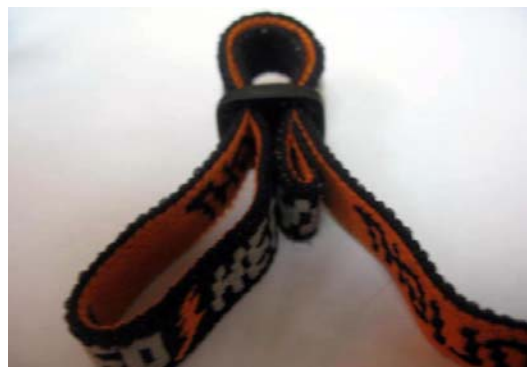
4) and across other hole of clip