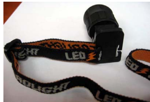
6) Hang in ends of strap hole of handlamp unit